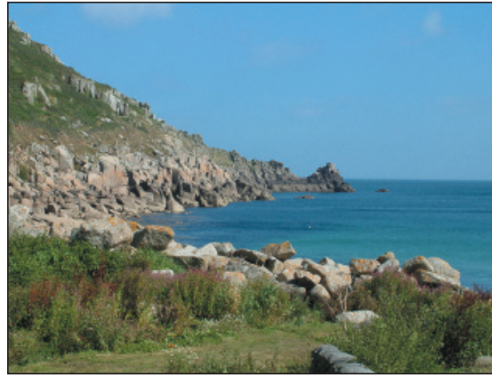
Lamorna Cove: Half Tide Rock, where the mermaid is said to sit and sing