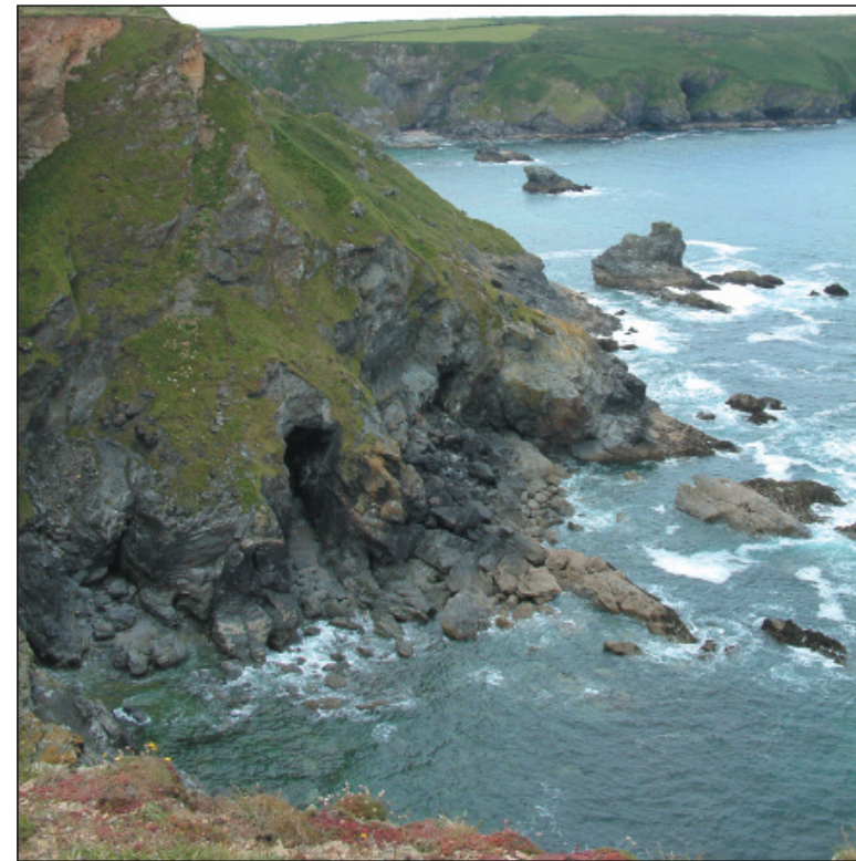
Hell's Mouth, Near Gwithian: This sheer 350-foot precipice is long associated with smuggling, shipwrecks, suicide and other macabre incidents.