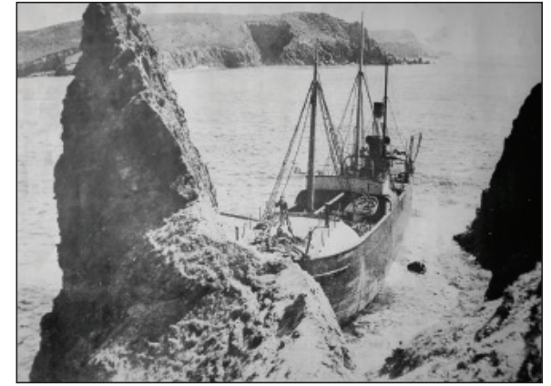
Print of SS Llandaff, Nanjizal Bay: A small Cardiff collier ship stranded at the western end of the bay, near Land's End.