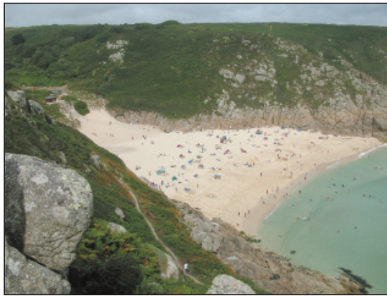
Porthcurno Cove: This popular tourist beach is the apparent location of the phantom black rigger.